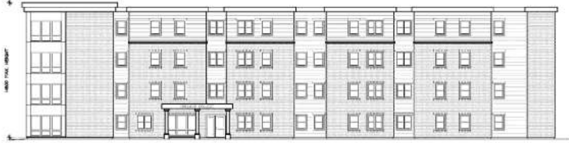
CUMBERLAND STREET ELEVATION