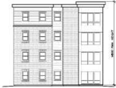
GRAFTON STREET ELEVATION